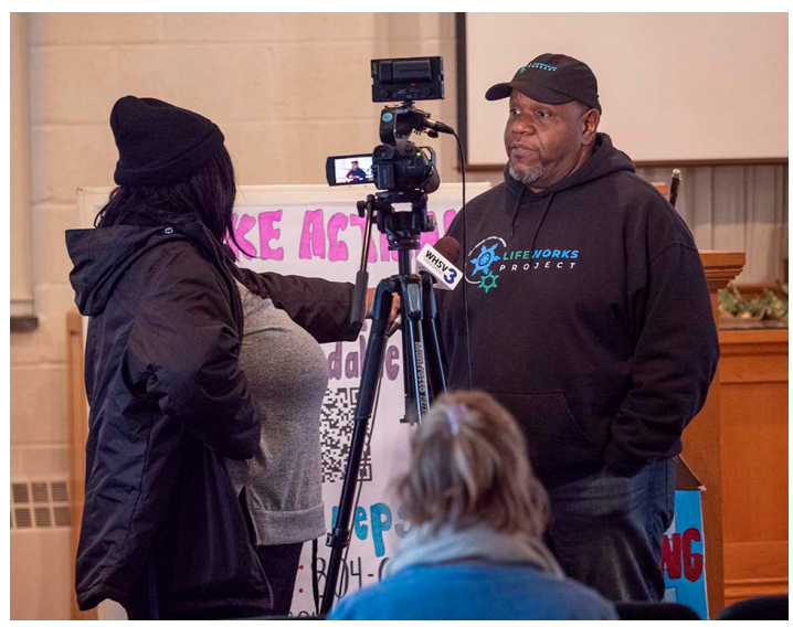
The Waynesboro Chapter's vigil was covered by local newspapers and TV before and after. From the WHSV article:

Three out of ten households in Virginia pay too much for housing, and the costs for both rent and homeownership have gone up exponentially in recent years. Speakers asked state legislators to allocate critical funding to affordable housing projects like Virginia's Housing Trust Fund, Housing Stability Fund, and Eviction Reduction Program.