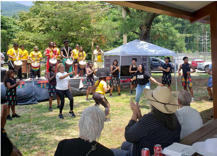
Kuumba Watoto Drum and Dance Ensemble at the Juneteenth celebration in Big Stone Gap. They are a "Drums Up Guns Down After School Program" from Knoxville.

Chapters around Virginia hosted or tabled at Juneteenth events throughout the weekend.