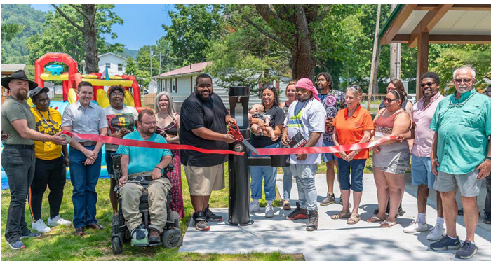
Wise County Chapter members attended the ribbon cutting for the new water fountain in June.