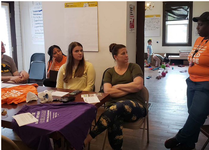
Mothers and caregivers at the Wise County Listening Session