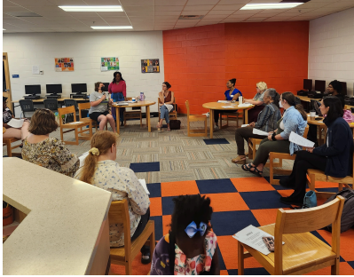
Wise County Dismantling Racism Workshop August 3, 2024

This month, our Wise County Chapter held a Dismantling Racism workshop for Wise County teachers and school administrators, specifically to address concerns of systemic racism in the public school system. The workshop was rich with enthusiastic discussion, sharing personal experiences, and mutual respect amongst unlikely conversation partners.