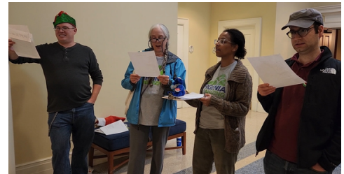
Newport News/Hampton Chapter members singing carols to the City Council.

On December 10, the Newport News/Hampton Chapter went "Caroling for a Cause" at the Newport News City Council meeting held at Christopher Newport University. Chapter members sang carols about the need for a shelter on the peninsula and called out city council to address this much-needed resource.